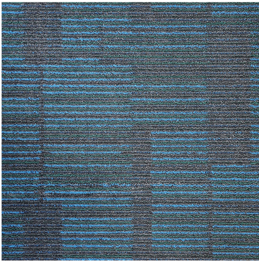
□ (BB400)102- PCC