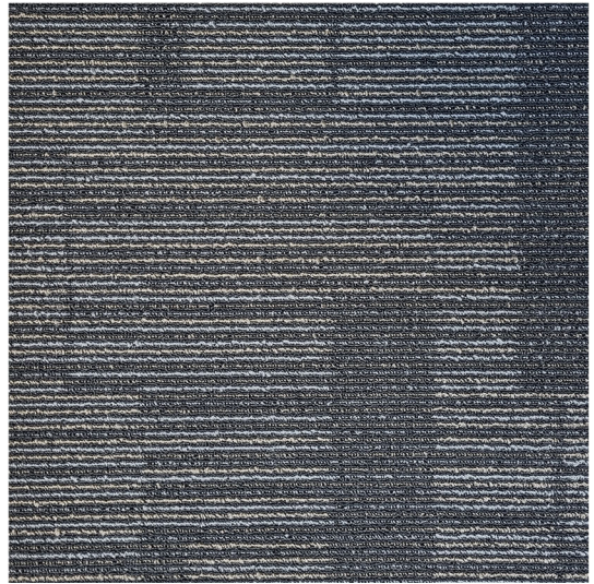
□ (BB400)102- PCA