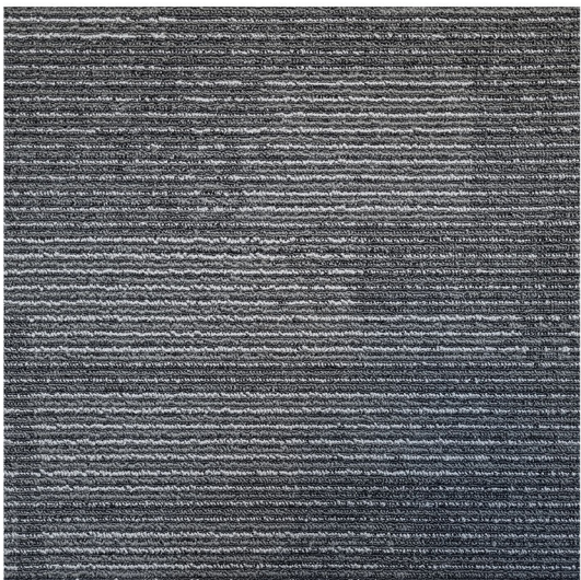
□ (BC400)156- PB02