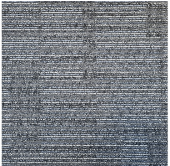
□ (BB400)102- PC7